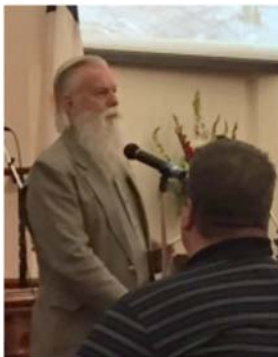
A time of sharing

Commit yourselves to the cause of Christ, so that the next 200 years might produce even greater fruit than your first 200 years as a congregation. Give yourselves fully to the work of seeking first His kingdom and His righteousness so that you might continue to bear fruit that lasts for all eternity. Keep on exercising much faith and taking bold risks for the sake of the Gospel of Jesus Christ and the advancement of His kingdom! Stay faithful to the call of preaching Jesus and the coming of His kingdom!