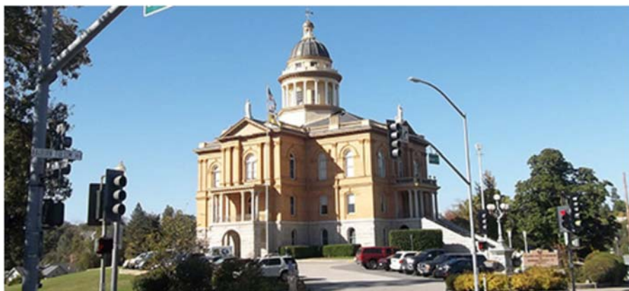
The Placer County Courthouse

We got a tragic taste of the old west when a pair of desperados killed a policeman in Sacramento and then fled to Auburn that day. The shooter was finally caught, but not before killing a second officer and wounding a third officer and a civilian. Frankly, we were glad to get out of town.