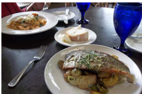
An example of Lucca's fine fare

We arrived in Sacramento a day early and decided to play tourists with the extra time. Thursday afternoon and evening we walked about the neighborhood of our hotel and found a great restaurant called Lucca http://www.luccarestaurant.com/ not two blocks away.