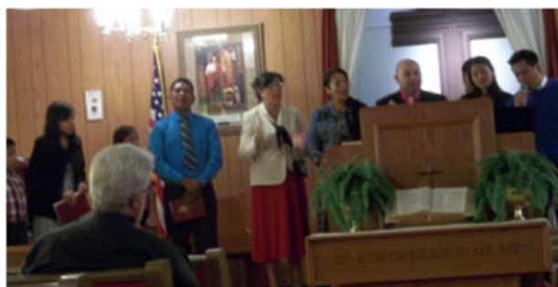
Special music from a Hispanic group

The Wheatland Church served everybody one last time for lunch. The food was plentiful and the dessert table irresistible.