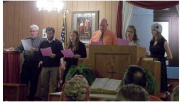
A group from the Manteca Church shares special music

being true to the word of God and faithful in service.