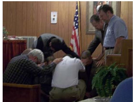
Prayer for the ordinands

To start the day on Saturday the Wheatland folks served everybody a farmer's breakfast which included pancakes, bacon, sausage, toast, fruit, scrambled eggs, sticky buns, and more.