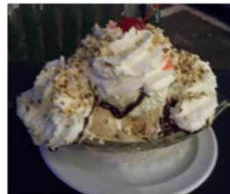
Ed's triple dip sundae