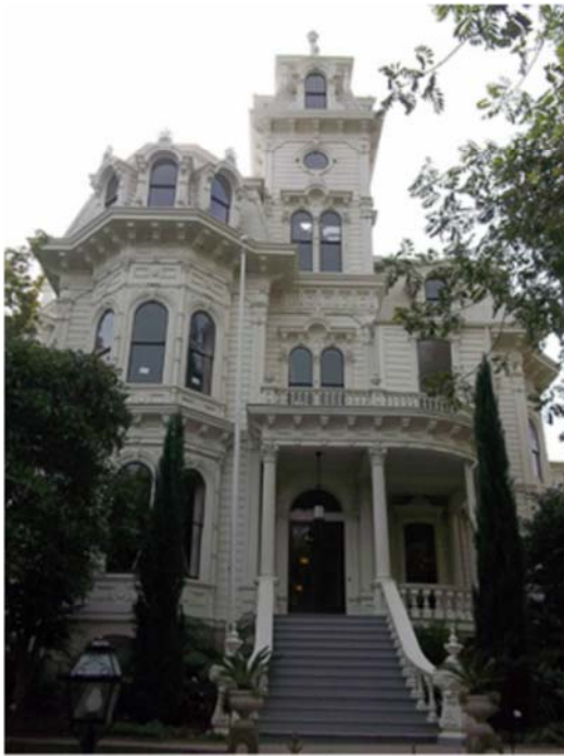
The historic governor's mansion