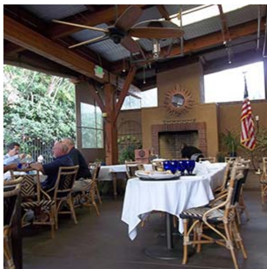
Dining al fresco at Lucca's