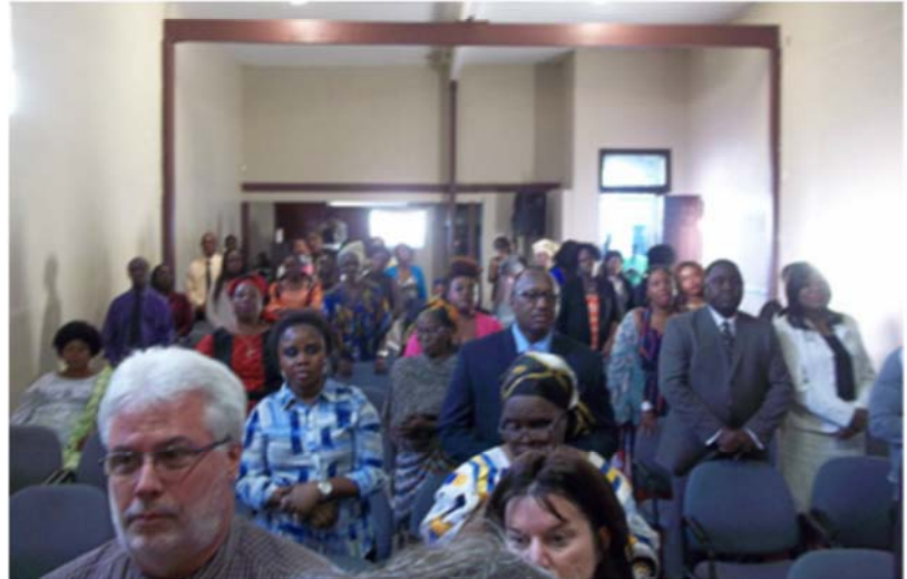
A view of the congregation