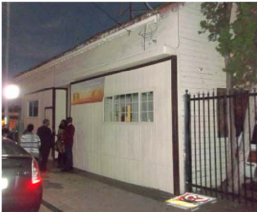
An outside view of the church facility

After a good hour of fellowship we said our farewells and drove back to Sacramento for the night. The next day we needed to arise at 4 to make our 6 a.m. flight back to Detroit. Monday was a long day, but full of memories of our California visit.