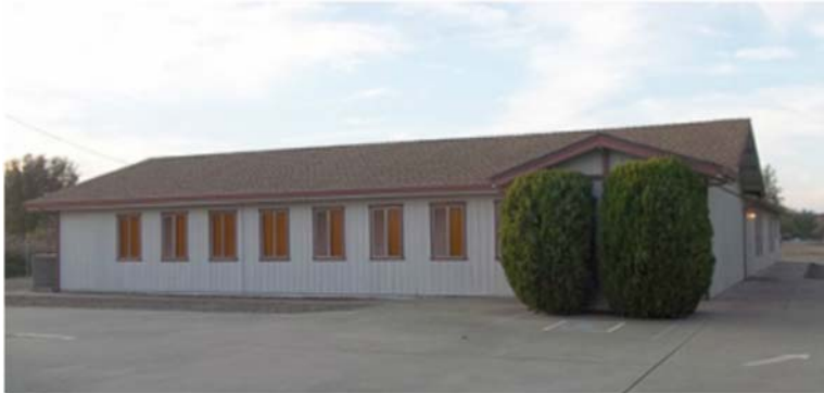
The Wheatland building