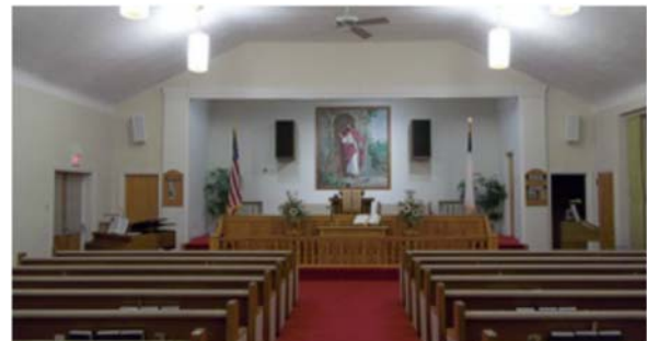
Inside the Windsor sanctuary