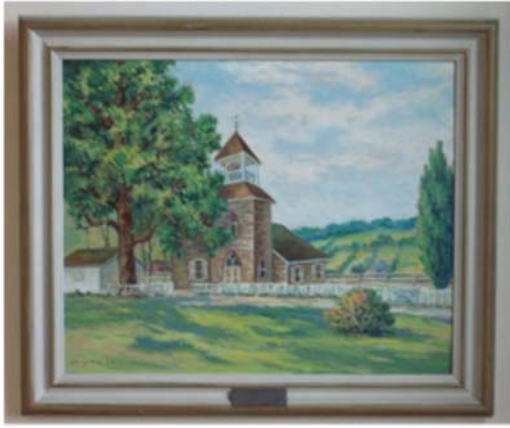
Painting of the old stone bethel

The Windsor Church dates back to the great revival of 1858 and the work of Jacob Keller. Because of the Civil War and subsequent economics the church continued to meet in homes until 1876 when the congregation built a schoolhouse-style bethel out of stone. It added a bell tower at the turn of the twentieth century. The church dedicated its current brick worship and educational facility on Manor Road in 1955 and the parsonage next door in 1959. The church also maintains a cemetery where the church triumphant awaits the great day of the Lord.