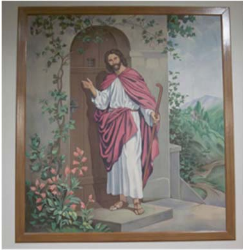
Painting at the front of the sanctuary

Sunday morning the church followed its regular order of worship, but the evening services were a bit freer. The piano and organ music certainly kept the singing lively. So everyone could track their decisions for a closer walk with Jesus we prepared a booklet with brief message outlines and a challenge for each service. The call for decisions focused on using the great commandment (Deuteronomy 6:5), calling upon each one to give body, soul, and spirit (will) in deeper dedication to Jesus in the five aspects of discipleship previously named. The booklet also provides an reminder of those decisions.