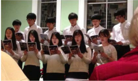
Global Vision Christian School Choir