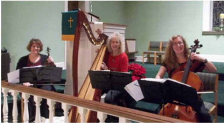
The Blythe Spirit Trio