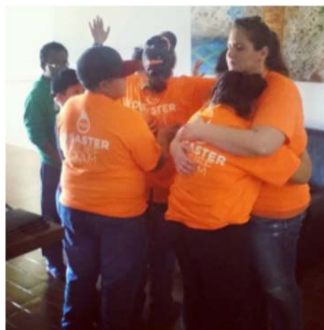
Firehouse Disaster Relief Team mobilizing for action in the wake of more tornado damage