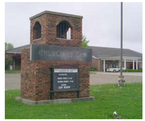
At the East Harrison Street Church of God