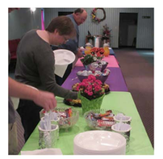
Snacks and refreshments