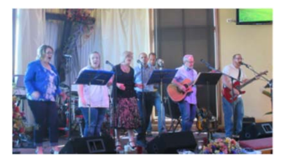
The LifeSpring worship team