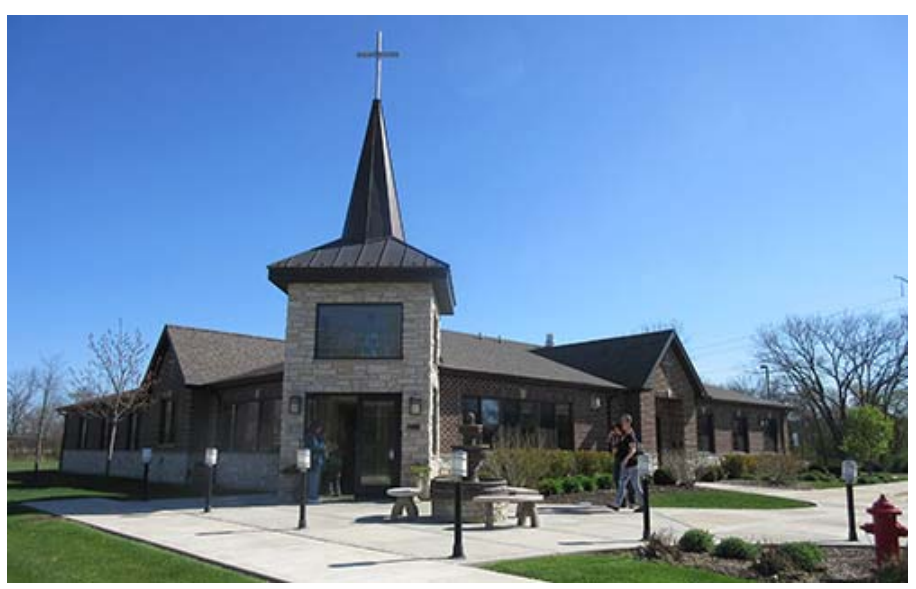
The LifeSpring facility