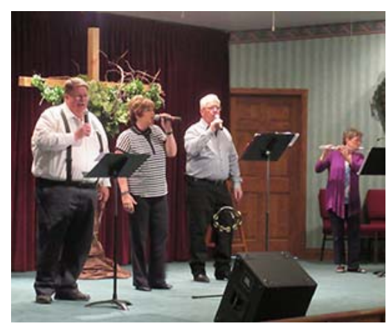
The East Harrison Street worship team