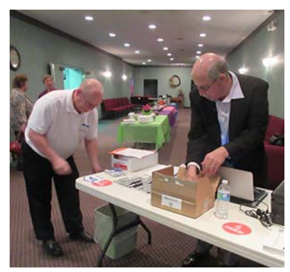
Setting up for the next MRC Kluster Meeting

Several weeks ago I reported on the Kluster Meeting at Idaville, IN. This week I'm sharing another such report. Instead of one large assembly this year the Midwest Region Conference (MRC) is holding a series of seven district gatherings across the region. The goal is to more effectively reach the grass roots and involve more churches by providing various workshops along with worship and some ministry up-dates. From everything I've seen and heard it seems to be working well.