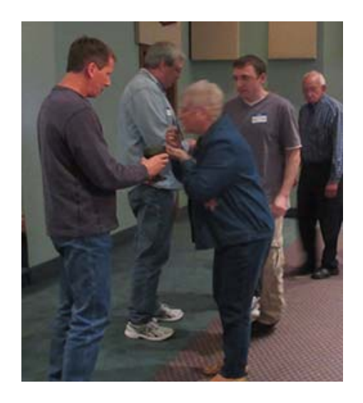
The Kluster ended about 4 p.m. and after packing our stuff we headed north three hours to Joliet for the night.