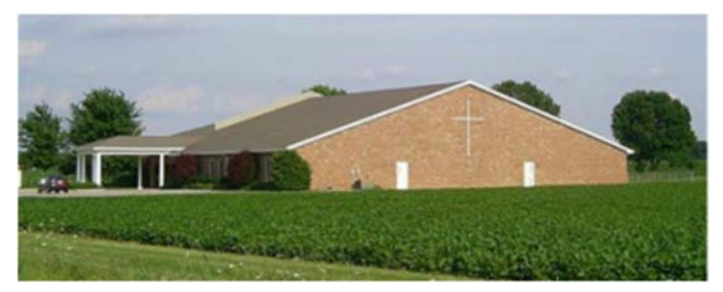
The East Harrison Street Church of God facility

Several weeks ago I reported on the Kluster Meeting at Idaville, IN. This week I'm sharing another such report. Instead of one large assembly this year the Midwest Region Conference (MRC) is holding a series of seven district gatherings across the region. The goal is to more effectively reach the grass roots and involve more churches by providing various workshops along with worship and some ministry up-dates. From everything I've seen and heard it seems to be working well.