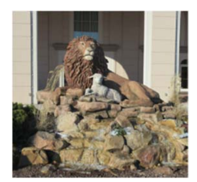
Statue in front of the Sight & Sound Theatre

However, the big treat of the weekend (other than spousal time together) was the Saturday afternoon visit to the Sight and Sound Theatre near Strasburg "where the Bible comes to life."