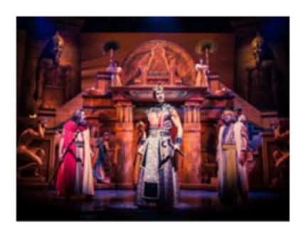
A scene from the "Moses" production