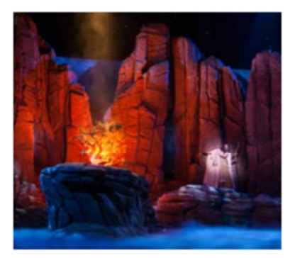
The burning bush