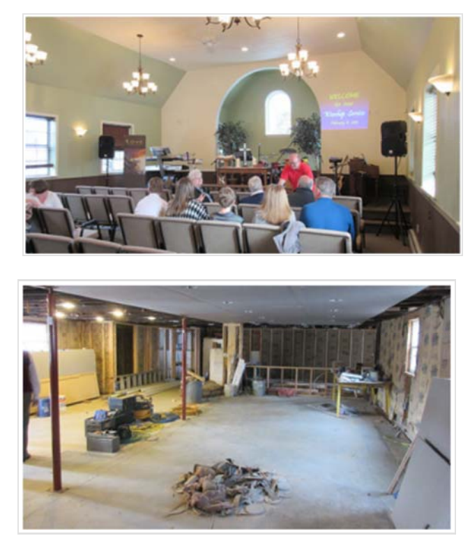
Lower level still in progress

The lower level, however, remained unfinished. A lot of the infrastructure (heating, electric, plumbing, etc.) is in place, but it needs drywall, trim and paint, as well as carpet.