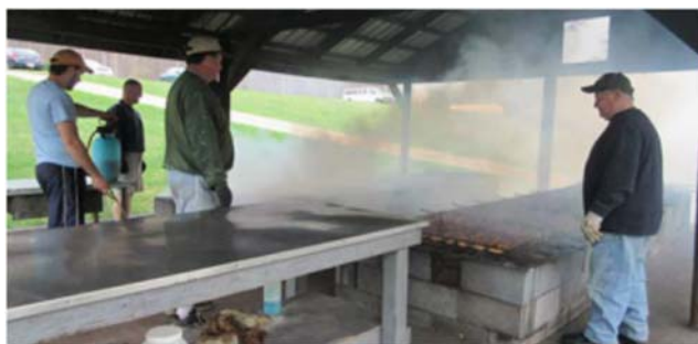
Checking out the chicken