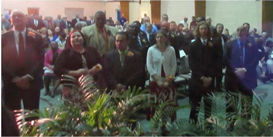
The ERC ordination candidates (pictured above and below)