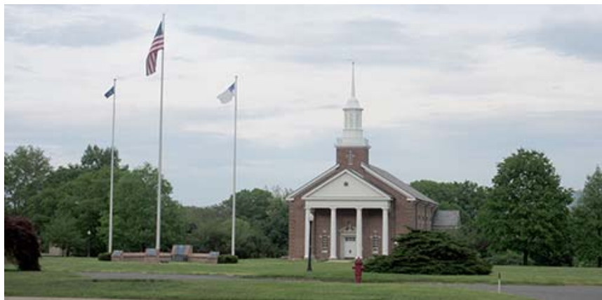
A view of the chapel at Scotland Campus

I must say things at Scotland Campus (SC) are hopping these days. The old inefficient central heating system has now been totally replaced by cost efficient heat systems which will cut the winter bill by two thirds and pay for itself in savings after three years. New leases have been signed with Alpha Gym, Edlantis Achievement Academy which provides therapy for autistic children, Scotland Performance Institute for under-privileged students with exceptional athletic ability, and Providence Academy "where orphaned and vulnerable children find ...education for today, shelter for tonight, and hope for eternity." Currently there are fifteen different ministry partners on or coming soon to Scotland Campus.