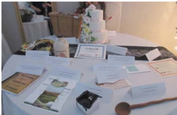
Items available for auction

This year the event was held in Boozer Dining Hall to facilitate the food service which was done in house and to provide a more intimate setting. When we arrived we enjoyed the fruit and cheese hors d'oeuvres as we meandered among the silent auction tables inspecting the goods.