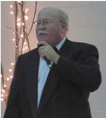
The auctioneer in action