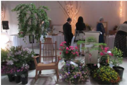
Plants ready to be auctioned